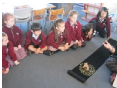
The Hand Timeline