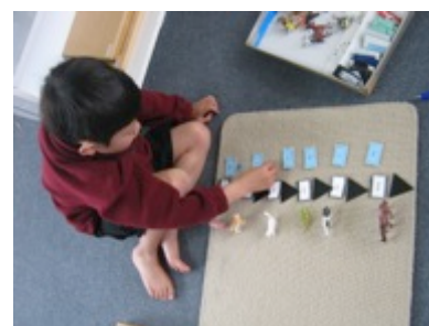
Grammar with the farm